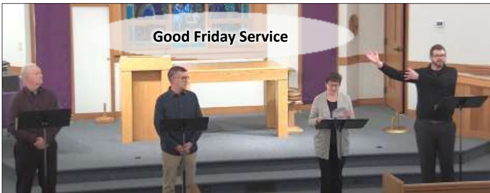
Good Friday Service

Thank you to all of you for joining in our services, helping at our events and making this Easter Season special! Alleluia!