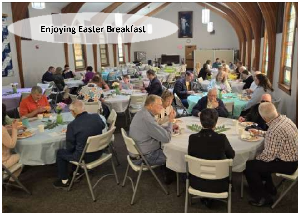
Enjoying Easter Breakfast