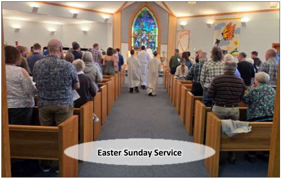
Easter Sunday Service