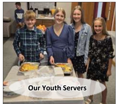
Our Youth Servers