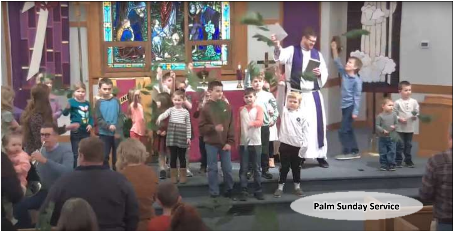
Palm Sunday Service