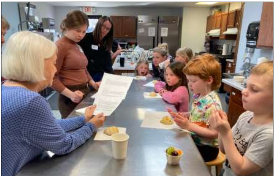
Families enjoyed making resurrection rolls after worship on Sunday, April 14.