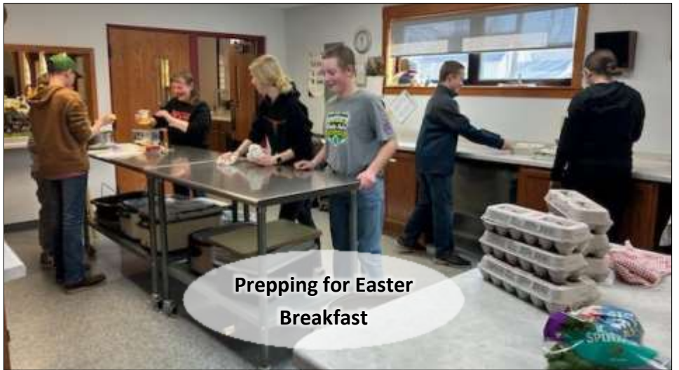
Prepping for Easter Breakfast