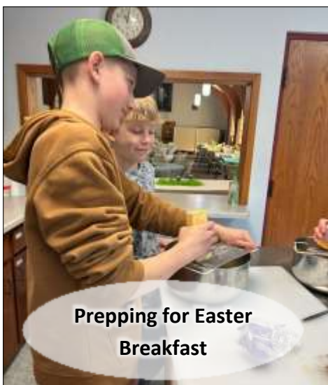
Prepping for Easter Breakfast