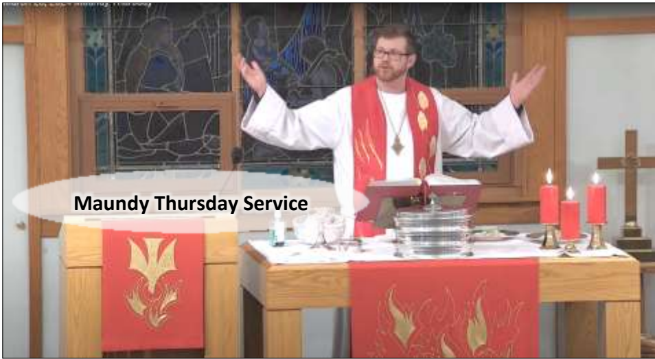
Maundy Thursday Service